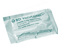
Castile soap towelette