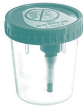
Urine collection cup